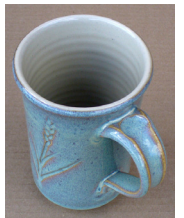
Stunning GR6-A transparent inside a buff stoneware mug at cone 6 (outside is GA6-C Alberta Slip blue)

Imagine making your cone 10R glazes using 90%+ of just one material and adding colorants, opacifiers, variegators, glossers or matters! Using Ravenscrag Slip you can do exactly this! Ravenscrag Slip is a conditioned natural combination of clays, fluxes and quartz. It is mined by Plainsman Clays in North America's premier “Clay Country” (near Ravenscrag, Saskatchewan, Canada).