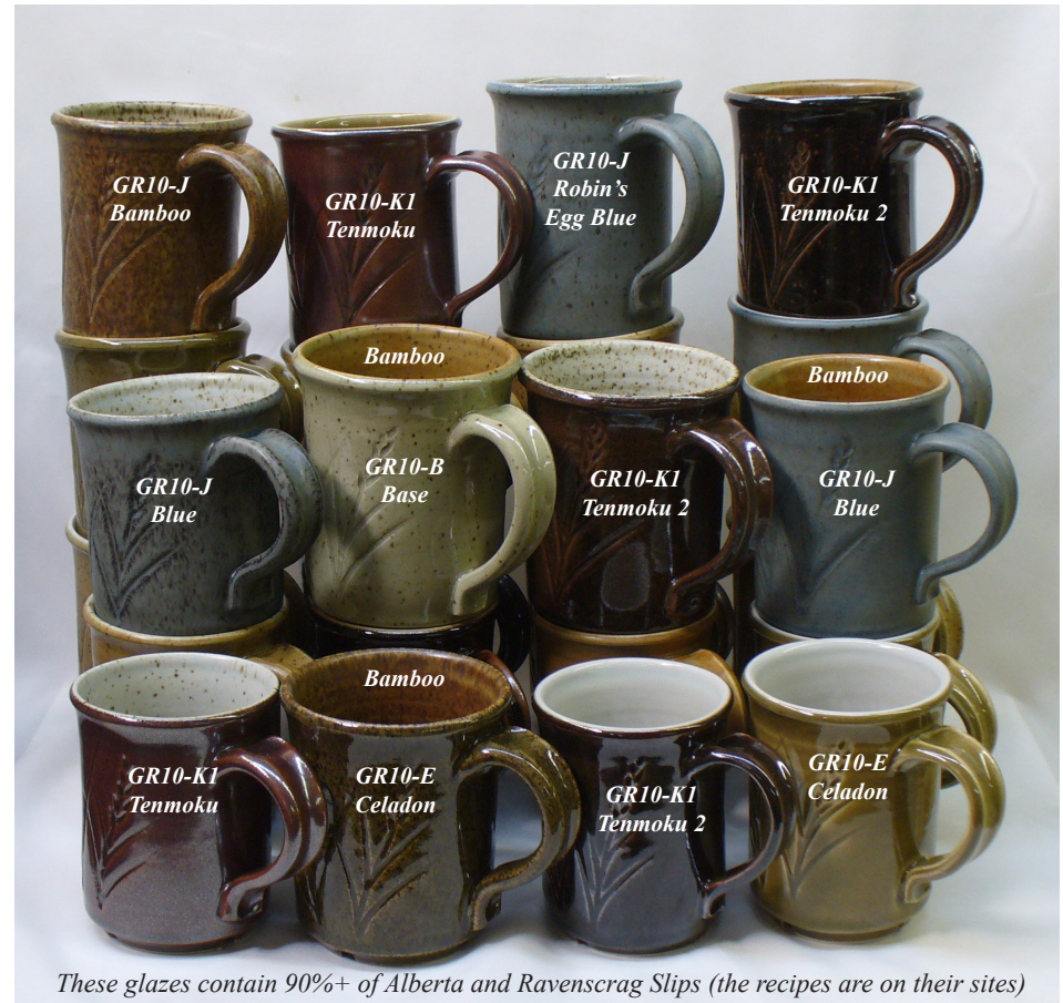
These glazes contain 90%+ of Alberta and Ravenscrag Slips (the recipes are on their sites)

PLAINSMAN Clays Limited http://plainsmanclays.com 702 Wood Street Medicine Hat, Alberta T1A 1E9 Canada Phone 403-527-8535 http://ravenscrag.com