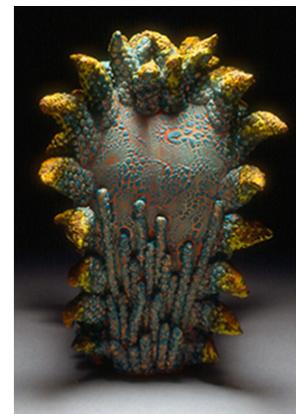
Plant-Creature, 30 x 20 x 28 cm., multiple fired from cone 6 to cone 06 Ox., 2001