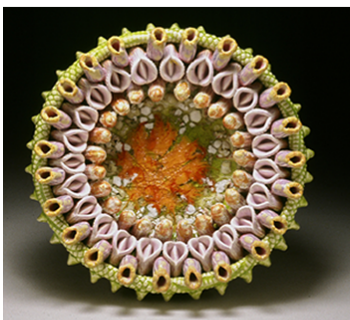
Plant-Creature, 25.5 x 25.5 x 1.4 cm., multiple fired from cone 6 to cone 06 Ox., 2003